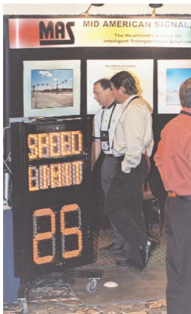
RIGHT: Mid-American Signal participated as a vendor.