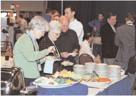
ABOVE: The buffet line