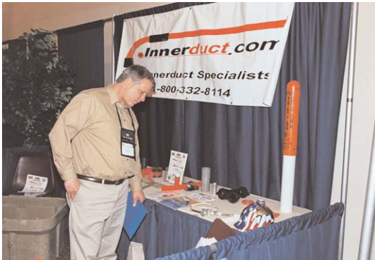
ABOVE: A member views a display.