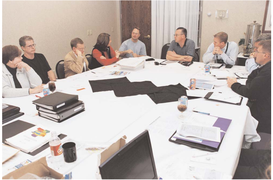
ABOVE: ITS Heartland Board Meeting