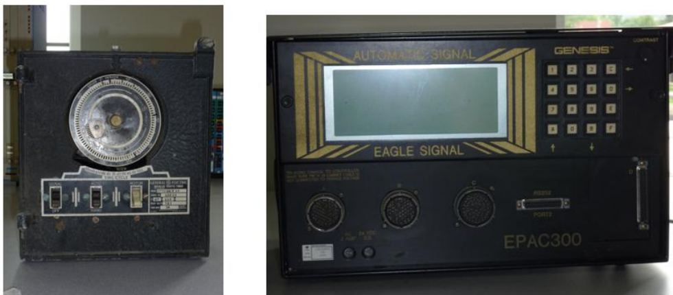
Figure 2. A 1940's vintage controller is on the left and on the right is a more modern controller.