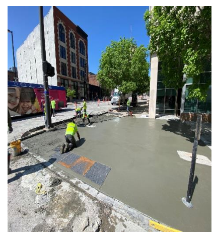
Figure 2: Poured sidewalk and ramp on 14<sup>th</sup> &Harney St

mainly on providing the people with disabilities an easy and safe way of crossing the road, as well as making the city look better. The most important thing for people with disabilities is the ramp, so my job was to set up five-foot openings for each ramp according to the city standards as well as a specific percentage of slope for the ramp and the landing. This experience of being in the field helped me to gain more confidence, and to be fully responsible of making decisions. This job was more focused on the construction side in civil engineering, which is really an interesting side that connects what you have studied to how it looks in the real life. There are some pictures I have taken from the field.