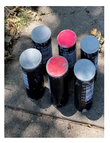
Figure 4: Concrete test cylinders