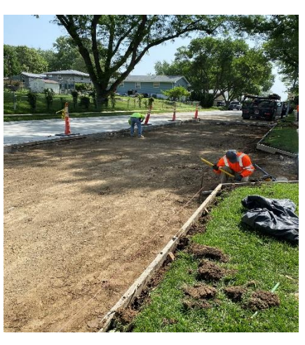
Figure 3: Pavement repair